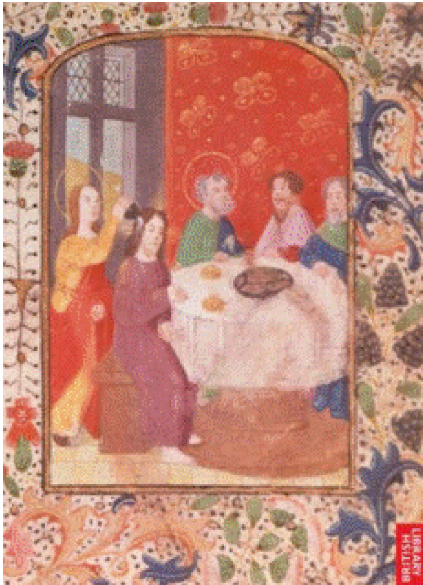
The Anointing at Bethany from a 15 th century illuminated manuscript.